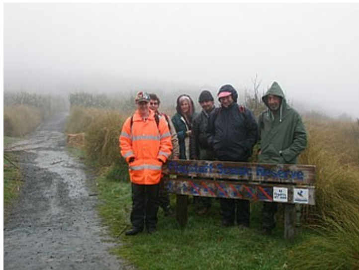
Pineapple Track, with the Ramblers.